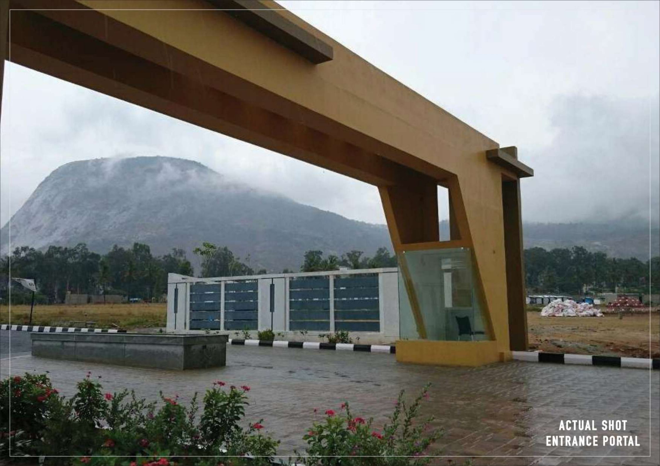
ACTUAL SHOT ENTRANCE PORTAL